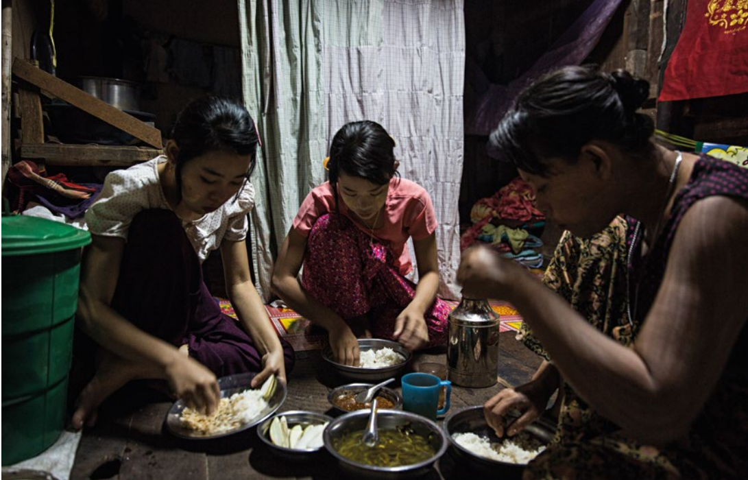
Garment factory workers eat dinner in their small home.

Most employers willingly turn a blind eye on this practice. Young workers are often hired without having their ID properly checked.