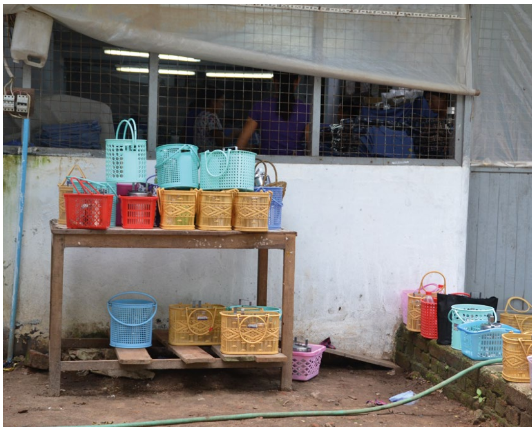
A garment factory in Myanmar (this factory was not included in the research).

At Factory 4, interviewed workers commented that there is a union active at the factory that was formed by the factory management. Factory 4 reacted to this statement saying that the union was formed free of obstruction from foreign management and that the union representatives were elected by the workers. 189