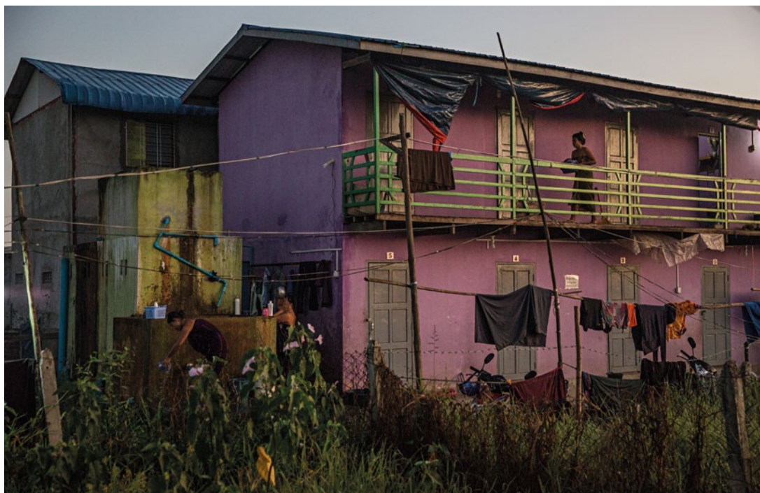
Exterior of a dormitory for garment factory workers.

understanding that the Myanmar labour movement and civil society is in full development; unions and labour NGOs are being established as we speak.