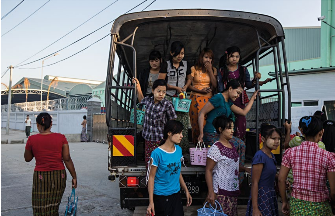
Garment factory workers get dropped off by a shuttle bus service in the morning before work.

The following buying companies did not respond to the review request: Lonsdale (Sports Direct), Kawasaki, Hudy, Erima, Henri Lloyd, Karrimor (Sports Direct), Pierre Cardin, Arrow, Bessshirt, Izumifuhaku, K2, and LL & S Purchasing Corp. (The Levy Group).