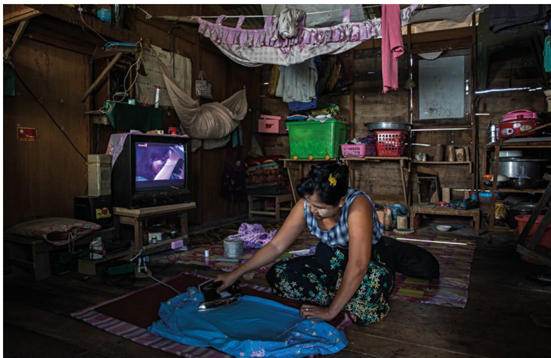
A woman irons clothes in her home.

Employers should, as a standard practice, conduct thorough age checks when hiring workers by checking their documents (NRC, township registration or birth certificate) and requiring a medical check. Young workers of 16-18 years old can only be employed with a valid CoF. Employers should be aware of unqualified medical bodies issuing forged certificates and NRCs. The employer should cover costs of CoF examinations. Buying companies, in turn, should be aware of their suppliers' administration and records being peppered with falsified documents.