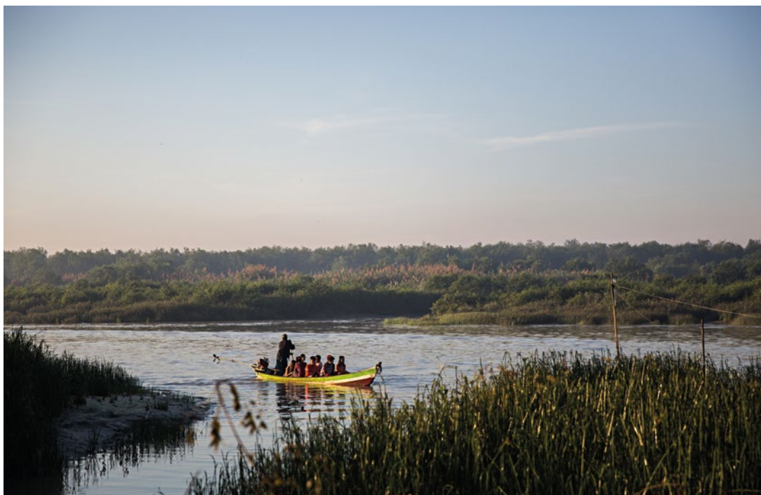
Garment factory workers travel by boat to work in the morning from a small village across the canal.

supplier list mentioned a number of factory names that no longer appear on the December 2016 version. According to C&A, one of the factories could not meet C&A's delivery deadlines. At two other factories, production was suspended due to poor audit results.