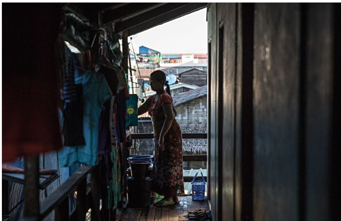
A garment factory worker hangs clothes out to dry at her dormitory in Yangon, Myanmar.

In May 2010, FWF adopted a formal position on Myanmar. At that time FWF was of the opinion that the situation in Myanmar was such that there was insufficient foundation for a credible process that could lead to improvements in working conditions in factories and that there was no credible structure for strengthening social dialogue between local stakeholders. Consequently, FWF required members and prospective members to phase out production at factories in Myanmar. 234