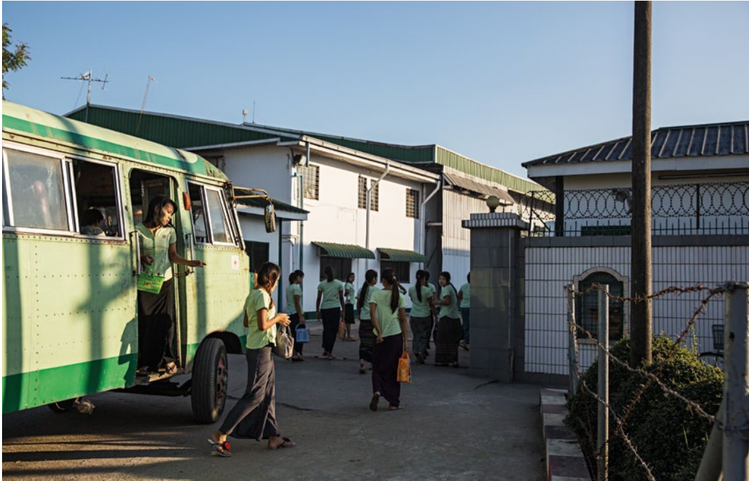
A shuttle bus drops off workers..