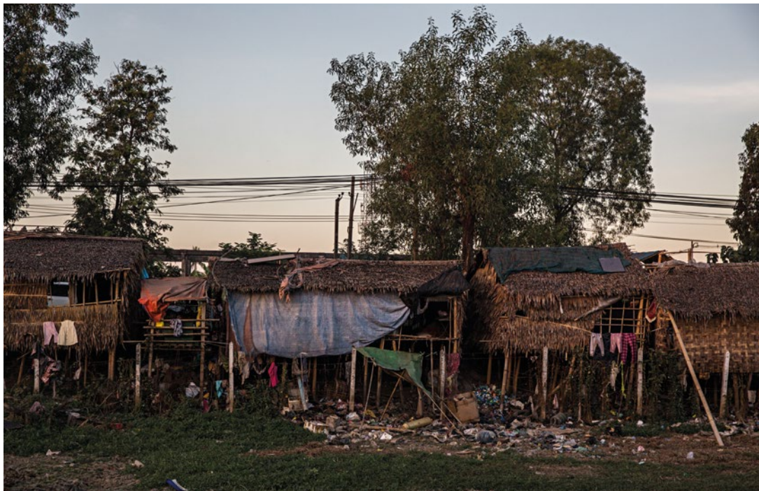
Squatter area for garment factory workers.

include risks related to land grabbing, questionable ownership and military influence, the powerful presence of foreign-owned garment factories, child labour and the position of ethnic workers.