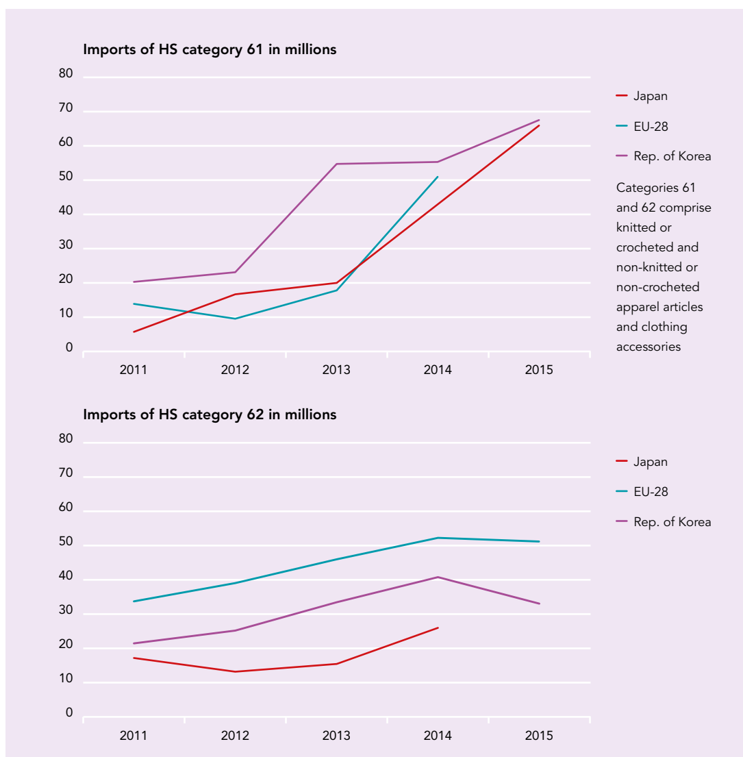
Figure 1 Imports of HS category 61 and 62 from Myanmar

133