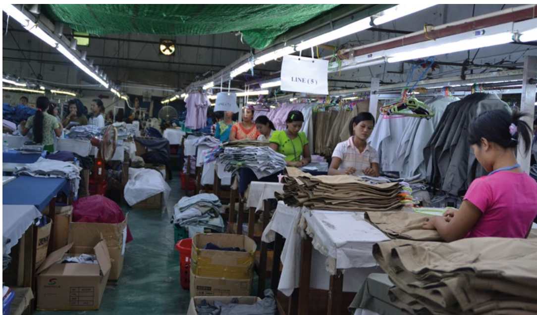
A garment factory in Myanmar (this factory was not included in the research).