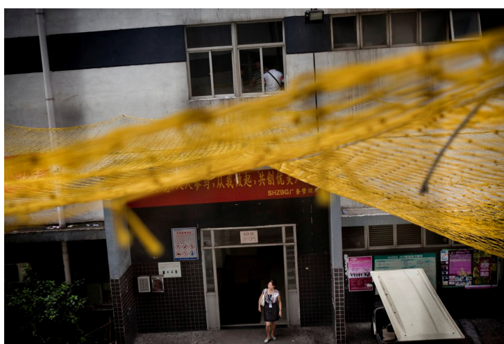
Upper: entrance of Foxconn campus Lower: safety net inside Foxconn campus