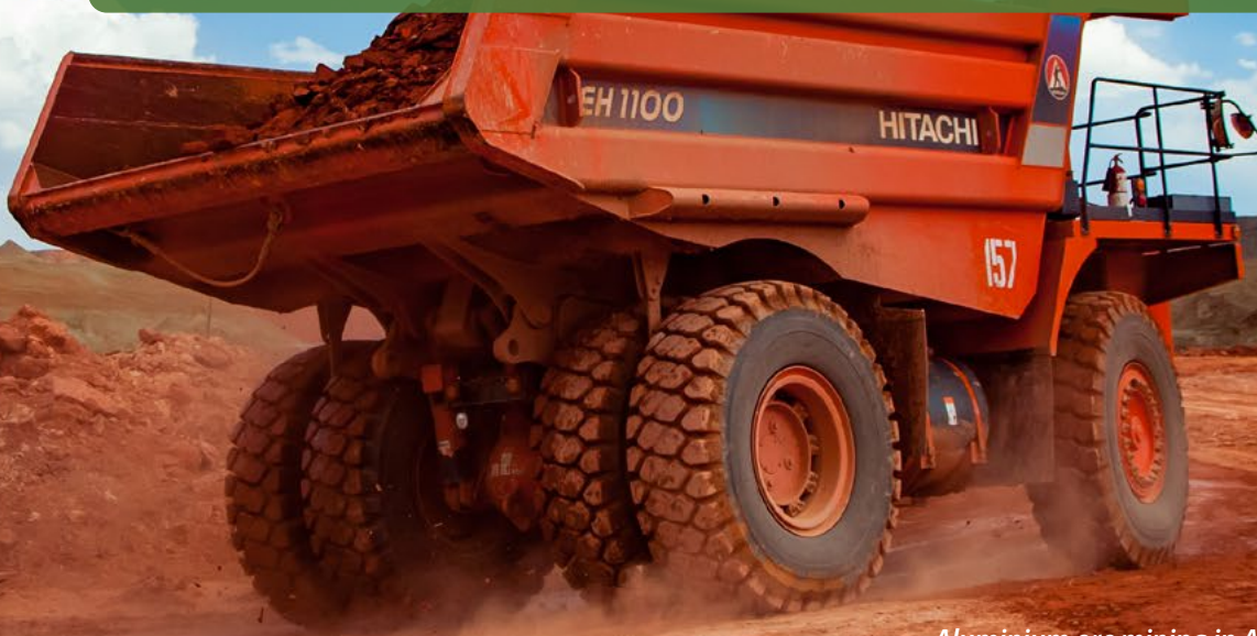
Aluminium ore mining in Arkalyk, Kazakhstan.