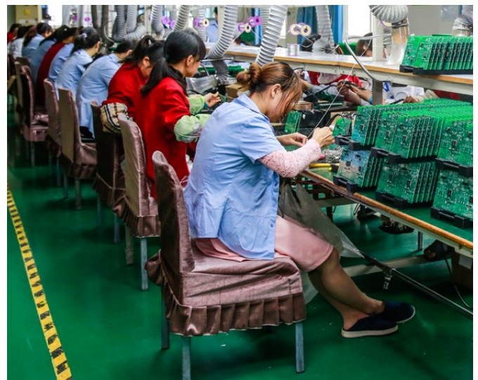
Workers putting chips on the circuit board in a factory in Jiangxi, China.

Companies are expected to address all human rights impacts and risks, but if it is genuinely not possible for them to address all impacts and risks immediately or simultaneously, they can prioritize and sequence their actions. When companies do prioritize, this should be based on the severity of the impact and the likelihood of it occurring. In some cases, a company may be connected to an impact by virtue of its business model or due to systemic risks, or the company may have limited resources to address the impacts in question.