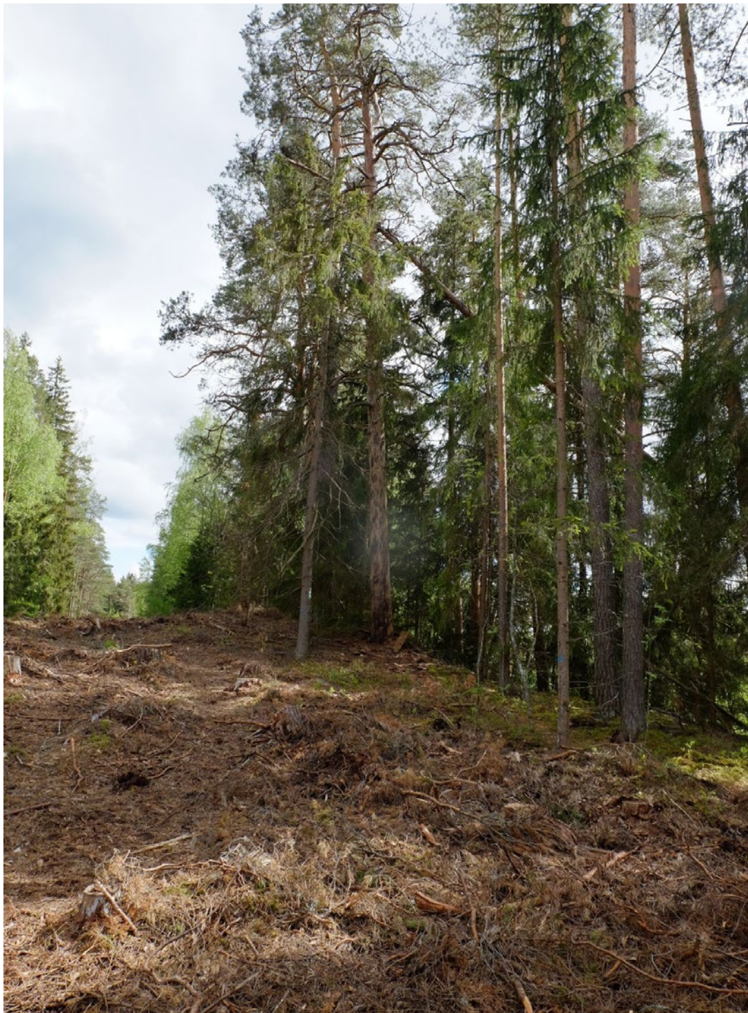
Photo 2: Old pine trees are visible on the edges of the clearcut WKH. © ELF, 24 May 2021