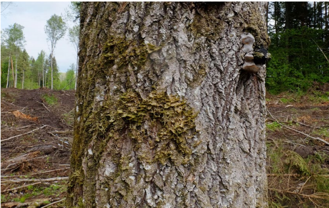
A moss called Neckera pennata was found on one of the retention trees left after logging. The moss is protected in Estonia and is also an indicator species of old-growth forests. © ELF, 24 May 2021