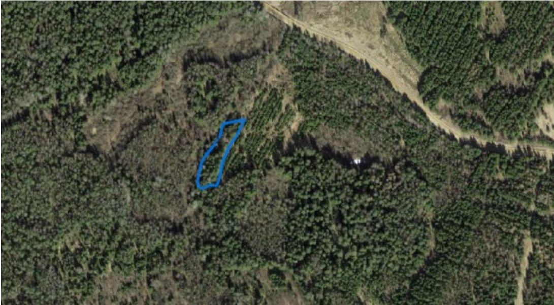
Photo 4: A WKH near Harjuküla village which was logged before it could be registered as such. © Estonian Land Board, 26 May 2021