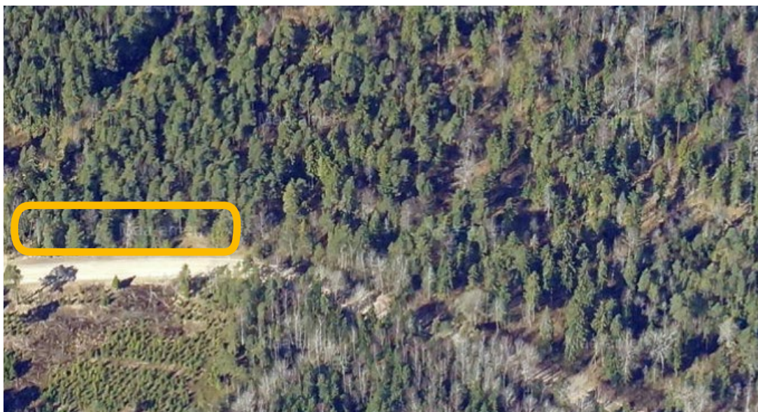
Photo 19: The Hinovariku site. The area with the cross trees that will be logged in 2018 is marked yellow. © Estonian Land Board, 16 April 2016

Cross trees in Hinovariku, Põlva County, South-East Estonia were cut and damaged in 2018. A few cross trees were left after logging, but were damaged because no buffer zone was left around them (see Photo 21). 85 In its answer to an FOI request issued by ELF, RMK confirmed that timber from these subcompartments was sold to Osula Graanul OÜ. 86