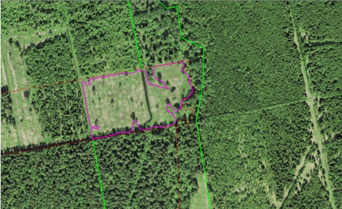
Photo 8: Nõmme, Pärnu County. The red line marks the land unit of Karo Mets OÜ forest company, green is the breeding habitat of hazel grouse and pink is forest loss/clearcut from 2014-2018. The water protection zone is also clearcut.