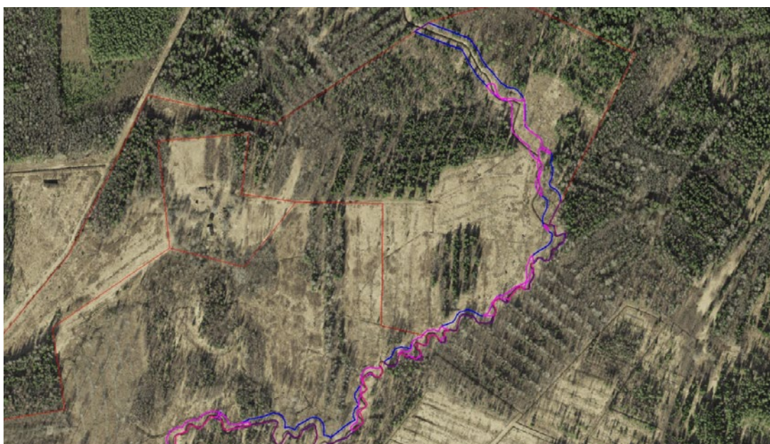
Photo 29: Kõdu, Järva County. The red line marks the land unit of Roger Puit AS forest company. The blue line is the water protection zone and pink is the forest loss/clearcut during the years 2014-2018.

Madara jõgi is a small river in a natural bed in Kõdu, Järva County, Central Estonia, running through lands owned by Graanul Invest. The aerial photo (see Photo 29 and Photo 30) show that Graanul Invest has clearcut most of the riverbanks on this property in Kõdu, Järva county.