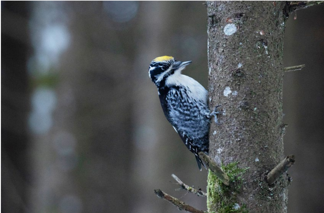
Male Three-toed Woodpecker in a Conifer Forest in Estonia.

The report is structured as follows: Executive Summary followed by Chapter 1, which presents the research context and Chapter 2, which outlines the research approach and methodology. In Chapter 3 to 5, the damage caused by logging in three different types of forests or forest areas are ascertained: High Conservation Value Forest (HCVF), forest watersheds and peatland forests. The last chapter draws together conclusions.