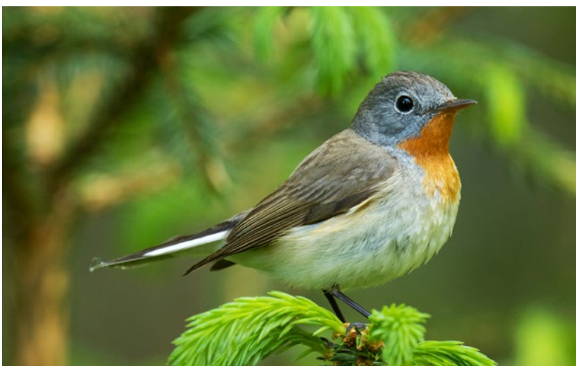
Male Red-Breasted Flycatcher in forest in Central Estonia

The red-breasted flycatcher ( Ficedula parva ) is an endangered old-forest bird species that commonly lives in the most fertile forest types. It is also listed in Annex I of the EU Birds Directive. Destructive logging has taken place in the mapped habitat of the red-breasted flycatcher 70 on Graanul Invest-owned land in Karjasoo, Viljandi County, Central Estonia (see Photo 9).