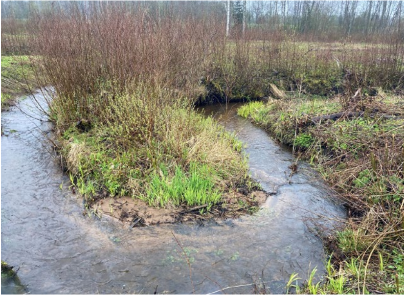
Photo 23: A clearcut area on Kivioja streamside showing washed out soil.