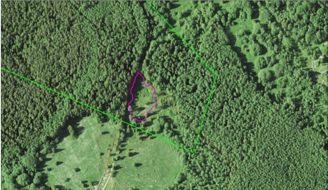
Photo 7: Parksi, Harju County, Lahemaa Natura 2000 area. The red line marks the land unit of Karo Mets OÜ forest company. The green line is the habitat of the three-toed woodpecker and pink is forest loss/clearcut from 2014-2018.