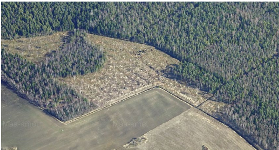
Photo 21: The same location as Figure 28 but on the oblique aerial photo. Water bodies are visible on the edges of the clearcut areas.