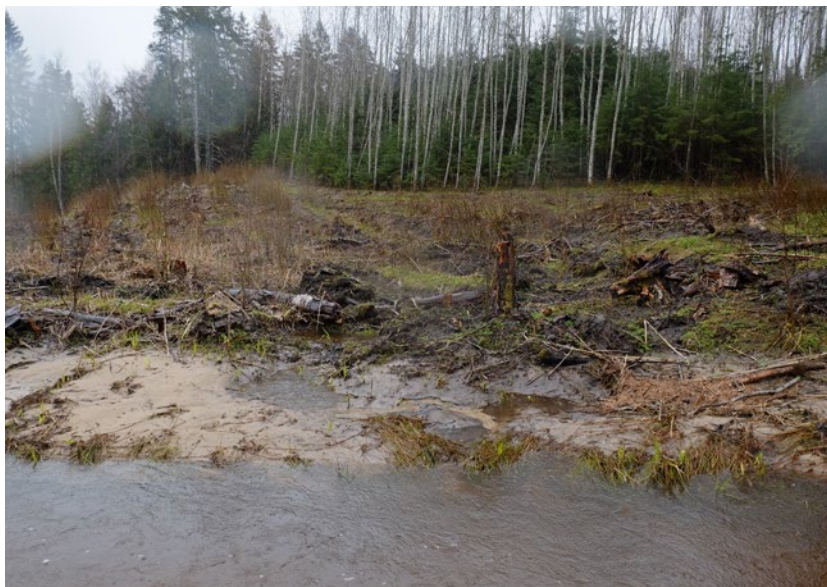
Photo 28: Clearcutting on the streamside has damaged the soil and the top soil has washed away. © ELF, 3 May 2021