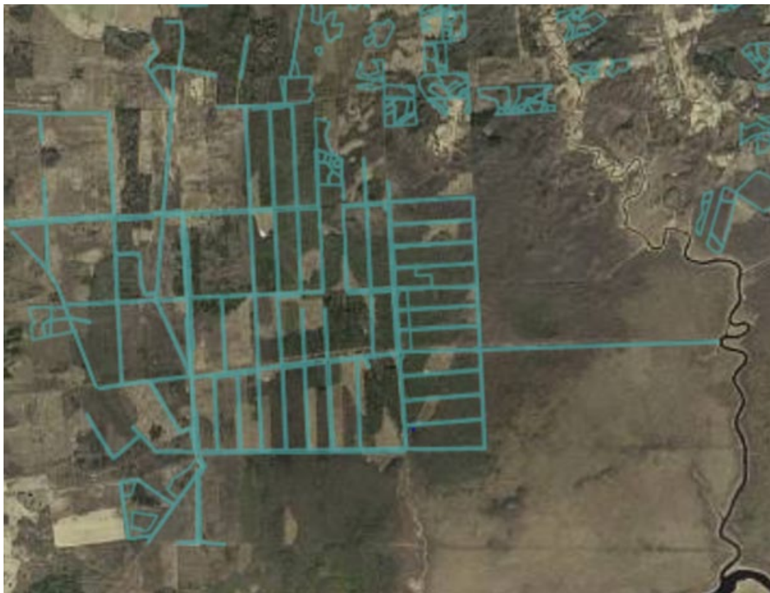
Photo 37: Satellite image of Kõrgeperve state forest with the ditches planned for renovation in light blue.