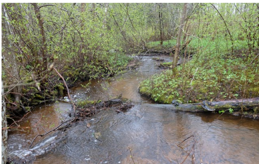
Photo 22: Kivioja streamside in a section where no logging took place. © ELF, 3 May 2021

Kivioja is a mostly natural forest stream in South-East Estonia (see Photo 22). Recently trees were clearcut next to this stream on Graanul Invest-owned lands (see Photo 23 and Photo 24). It is evident from the pictures that no restriction zone was left to prevent excess nutrient flow to the stream, or avoid soil erosion of the riverside. There were no trees left on the clearcuts in the 10 metre restriction zones. Also shallow ditches had been dug to drain the excess water from the clearcut, thereby increasing the nutrition and sediment load from the freshly cut area.