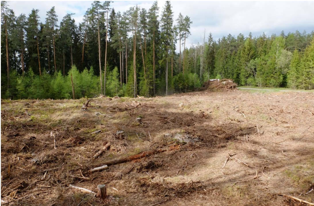
Photo 1: A clearcut WKH in Jõeveere village that never made it to the official environment registry to gain formal protection. © ELF, May 2021

A WKH with an area of 0.7 hectares was clearcut in Jõeveere village, South-East Estonia (see Photo 1). The WKH was mapped in August 2020 but was felled before it was officially registered and given formal protection. It was a pine forest with uneven ground surface that bordered the high banks of the Võhandu river. On the WKH mapping form, it is written that the forest used to have pine trees hundreds years old and an old-growth forest structure (see Photo 2).