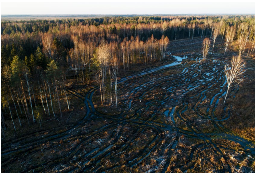
Forest land with Peaty soil after Clearcutting and Mineralizing in Central Estonia.

The research team also visited a number of locations to better assess and document the field level impacts of the destructive logging. After the findings were documented, companies and organisations involved in, or linked to, these cases were asked to review the relevant sections of the draft report prior to publication. A number of external experts were also consulted.