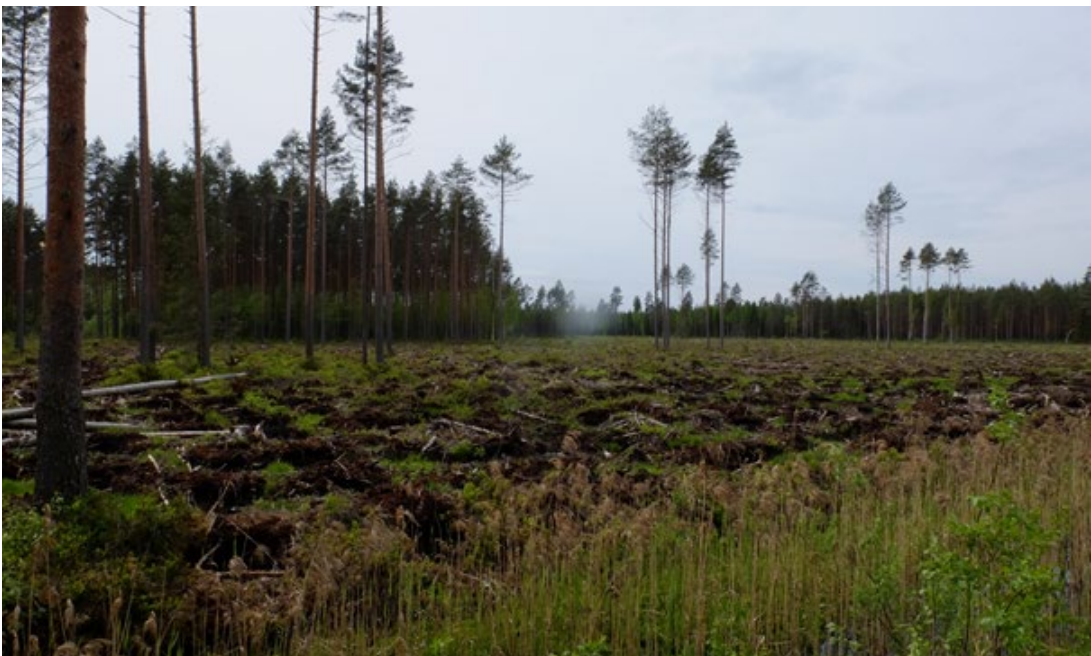
Photo 36: Clearcut area in Meleski state forest. © ELF, 25 May 2021

In the picture above (see Photo 35), it can be seen that deforestation of the ditch edges has already been carried out. From the picture it is also clear that the soil has been damaged with the thick black peat layer being exposed. This will cause carbon to be released from the peat soil.