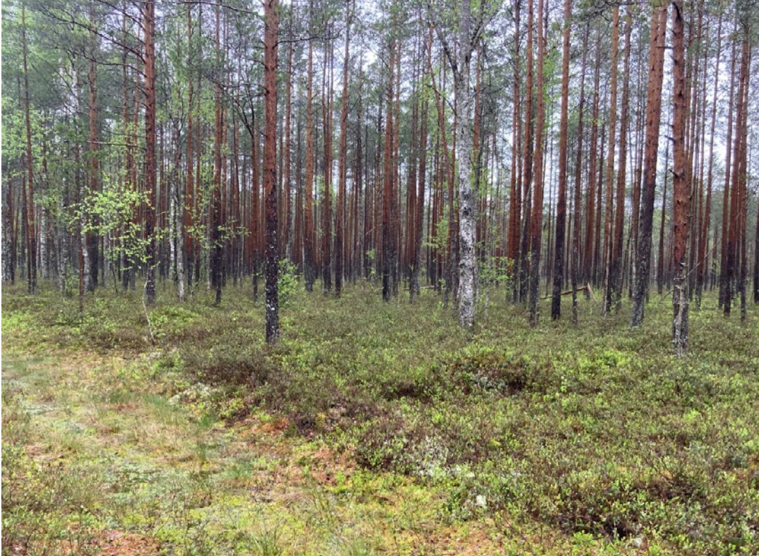
Photo 33: Photo of a ditch in an area of Kuremaa state forest where the drainage renovation is planned. © ELF, May 2021

The site is classified as oligotrophic bog in forestry terms and degraded wooded raised bog in ecological terms. The drainage – the lighter moss area (see Photo 33) – is nearly malfunctioning and overgrown with vegetation typical for raised bogs. The surrounding area vegetation, with very little Sphagnum cover, suggests that peat layer formation has stopped as a result of the drainage system constructed in the 1970s or 1980s.