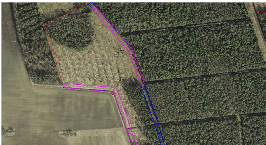
Photo 20: Clearcut area inside the 10-metre-wide water protection zone in Vasara, Viljandi County. The red line surrounds the land unit of a Graanul forest company. The blue line marks the 10-metre-wide water protection zone inside the Graanul land unit and pink indicates forest loss/clearcut during 2018-2019.

In Vasara, Viljandi County, South Estonia clearcut areas adjacent to the water bodies and inside the water protection were found (see Photo 20 and Photo 21).