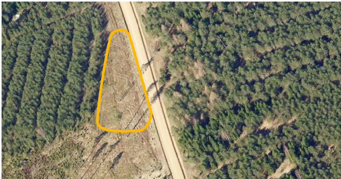
Photo 17: An orthophoto of the Erastvere-Sillaotsa site. The yellow line marks the logged area. © Estonian Land Board, 16 April 2019