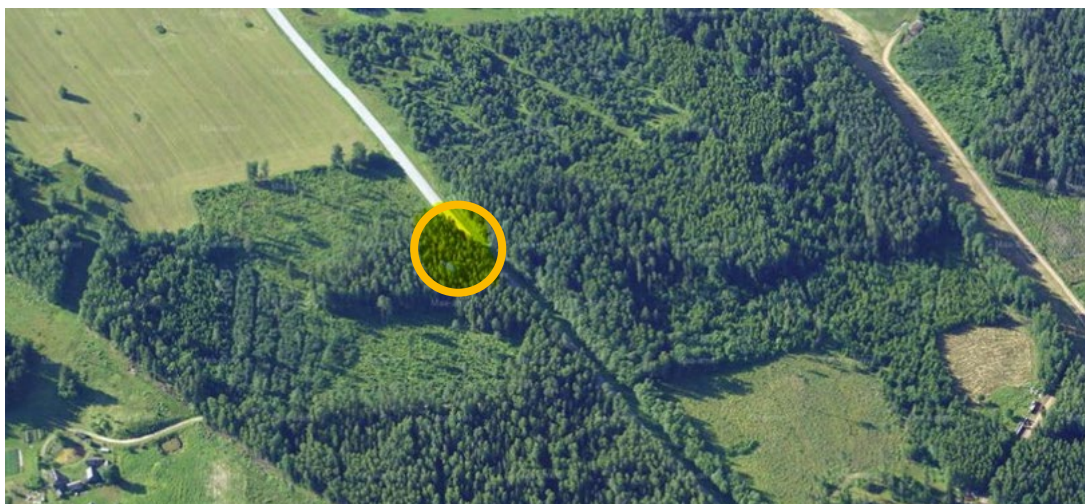
Photo 11: An aerial photo of the Partsimõisa site before the area (in yellow) with cross trees was logged.