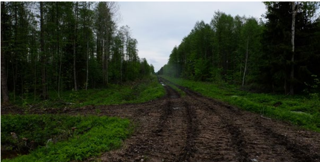
Photo 39: Soil damage in Kõrgeperve state forest. © ELF, 25 May 2021

Photo 38 shows an example of the clearcut felling near ditches in Kõrgeperve state forest. In this case, the deforestation has been carried out next to the Põdraoja stream. The stream's natural water bed has been reshaped in the past so that it flows straight.