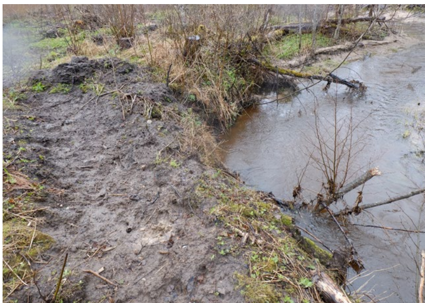
Photo 27: Tractor tracks next to the Kivila stream.