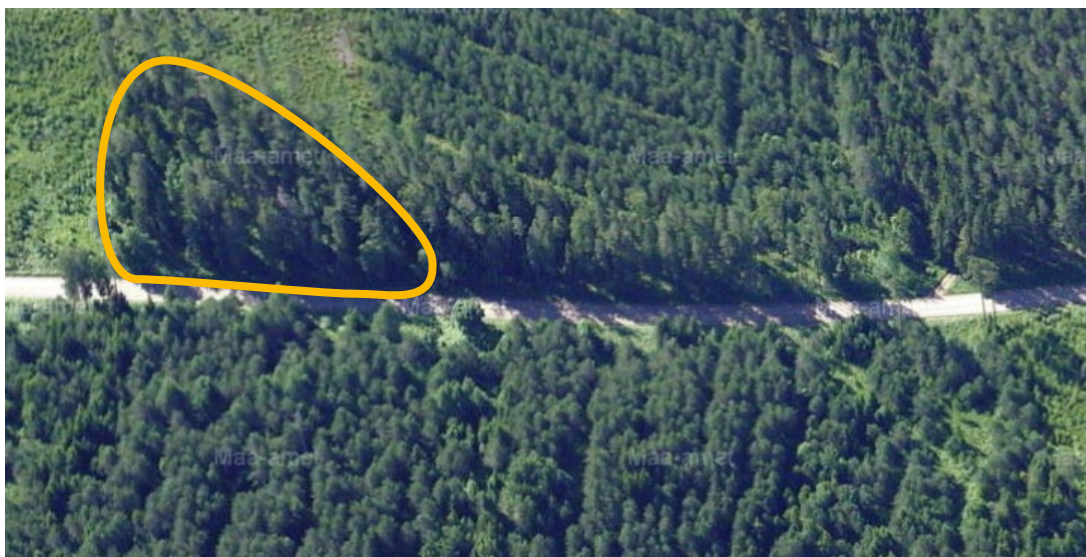
Photo 16: An orthophoto of the Erastvere-Sillaotsa site. The yellow line marks the to be logged area.

Cross trees in Erastvere-Sillaotsa, Põlva County, South-East Estonia were logged in 2018-2019 (see Photo 16 and Photo 17). In its answer to an FOI request issued by ELF, RMK confirmed that timber from this subcompartment was sold to Osula Graanul OÜ. 84