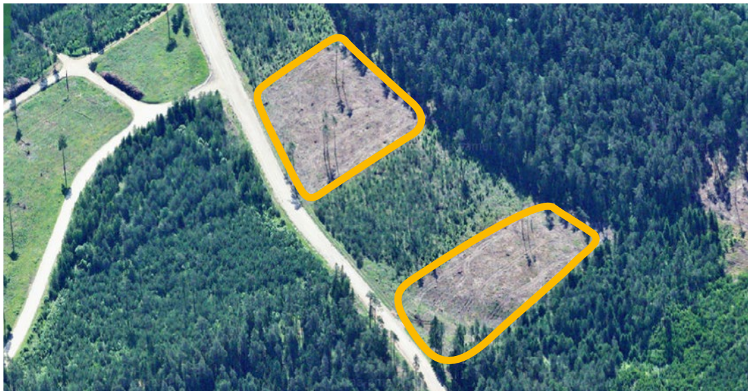
Photo 15: An orthophoto of the Tinnipalu site. The yellow line marks the logged area. © Estonian Land Board, 22 June 2020