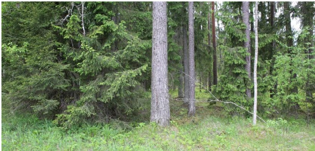
Photo 13: The Tinnipalu cross tree that was later felled. © Aarne Maasik, 6 November 2015

In Tinnipalu, Võru County, South Estonia, a cross tree was logged in 2019 (see Photo 13, Photo 14 and Photo 15). In its answer to an FOI request issued by ELF, RMK confirmed that timber from this subcompartment was sold to Osula Graanul OÜ. 83