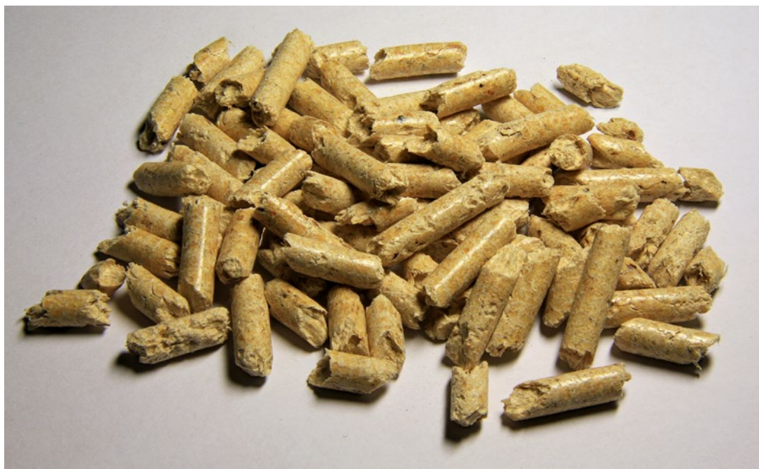
Wooden pellets.

Imports and use of wood pellets are fuelled by € 3.63 billion worth of subsidies under the Sustainable Energy Production (SDE+) scheme. Since 2016, energy companies can apply for subsidies for a period of eight years. In 2018, when SDE+ subsidies started being allocated, imports of wood pellets increased substantially. The volume of total imports doubled from 2018 to 2019 and then again from 2019 to 2020 to 2.5 million tonnes. Imports are expected to continue to rise to more than 3.4 million tonnes in the coming years, as the co-firing capacity of the Dutch power plants is not yet at full capacity. 8