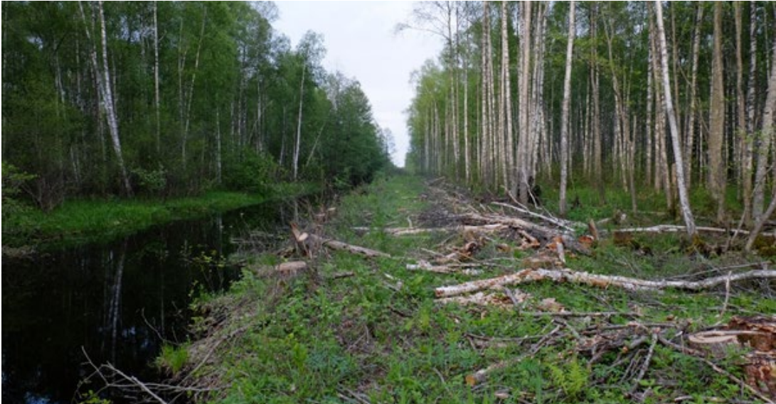
Photo 38: Clearcut area near Põdraoja stream in Kõrgeperve state forest. © ELF, 25 May 2021

Photo 38 shows an example of the clearcut felling near ditches in Kõrgeperve state forest. In this case, the deforestation has been carried out next to the Põdraoja stream. The stream's natural water bed has been reshaped in the past so that it flows straight.