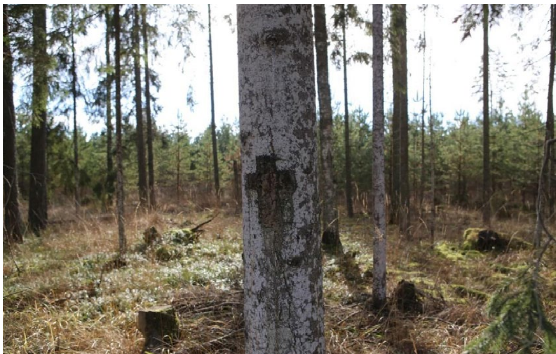
Photo 18: A Erastvere-Sillaotsa cross tree. © Aare Maasik, 24 October 2014