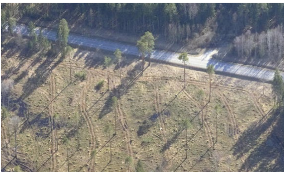
Photo 12: An aerial photo of the Toolamaa site. © Estonian Land Board, 27 March 2020

In Toolamaa, Põlva County, South Estonia six out of 13 cross trees on the site were logged in 2020 (see Photo 12). 81 It is unlikely that the remaining cross trees will last long under the new open conditions, as they are now exposed to the wind. In its answer to an FOI request issued by ELF, RMK confirmed that timber from these subcompartments was sold to Osula Graanul OÜ. 82