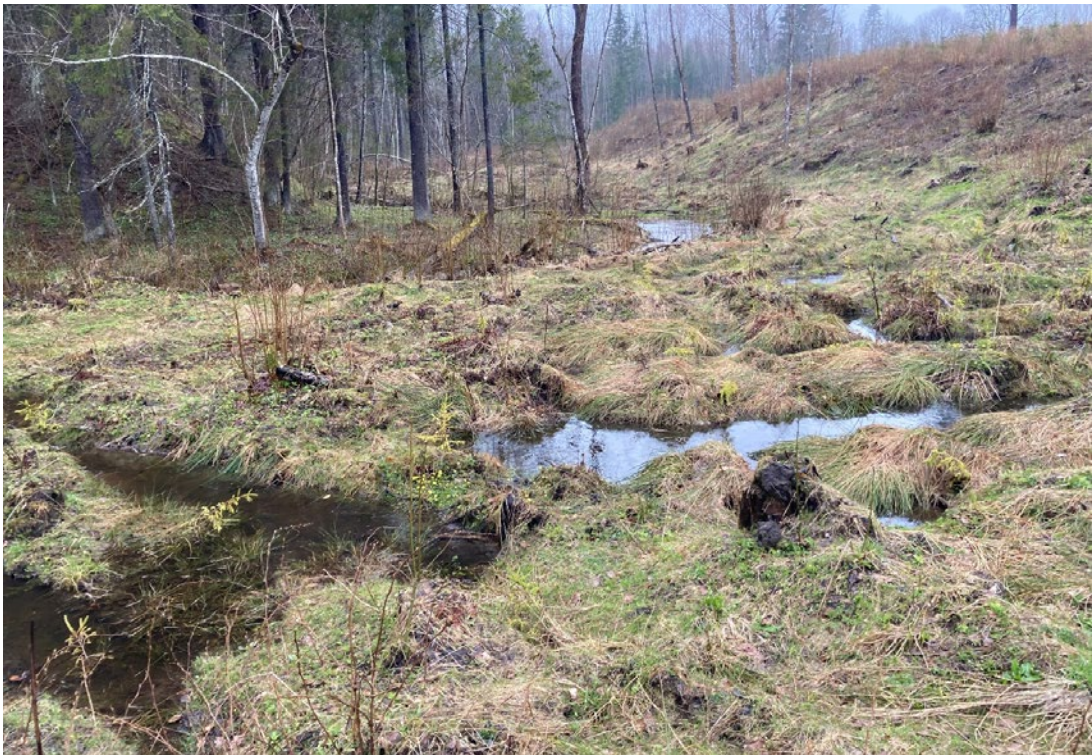
Photo 25: Vastsekivi stream in Haanja Natura 2000 area. One side of the stream is clearcut and the other is not. Deep tractor tracks can be seen.

Vastsekivi oja is a small natural forest stream in Haanja Natura 2000 area, Võru County, South Estonia. The Haanja Natura 2000 area has the habitat type 'water courses of plain to montane levels with' crowfoot river water vegetation as one of the site's protection aims. This habitat, listed in Annex I of the EU Habitat Directive, is considered to be in a bad conservation status in Scandinavian and Baltic countries. The stream has also been registered as a habitat of the otter (a species listed in the EU Habitat Directive Annex II and IV). Protecting otters is also a conservation aim of the Haanja Natura 2000 area. Whereas the rules for Natura 2000 areas require inventories to detect whether the Vastekivi oja stream is of the same habitat type as the rest of the area, no inventories have been conducted. A clearcut on Graanul Invest's land along the Vastsekivi oja took place 1-2 years ago. Deep tractor tracks can be observed that were left after the felling (see Photo 25).