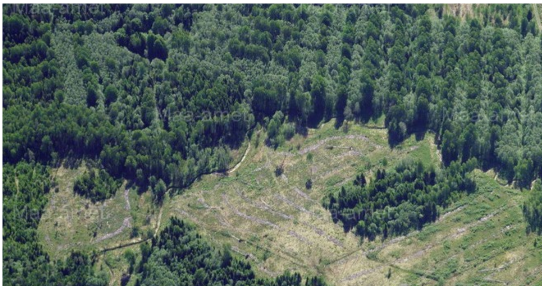
Photo 30: The same location on an oblique aerial photo taken on 26 May 2018.