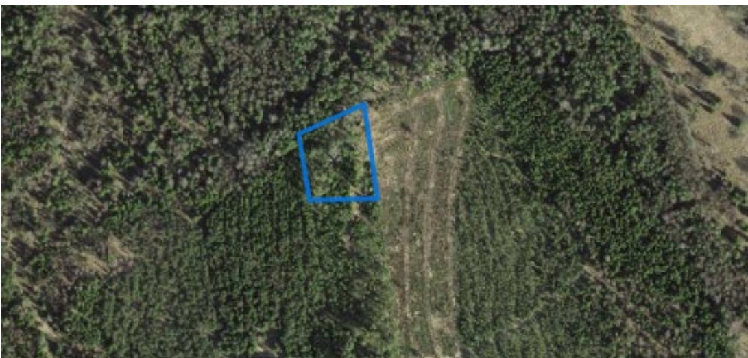
Photo 5: Clearcut WKH in Jõgeveste village never made it to the official registry to gain official protection. © Estonian Land Board, 26 May 2021

A WKH with an area of 0.4 hectares in Jõgeveste, Valga County, South Estonia was mapped in April 2020. The WKH was clearcut before it was officially registered (Photo 5). It was mainly a pine forest with a few spruces and aspens. According to the official expert mapping form, four indicator species that point to high natural value of these forests were found. Among the species that used to thrive in this WKH is the threatened fungus Fomitopsis rosea , that lives on coarse deadwood.