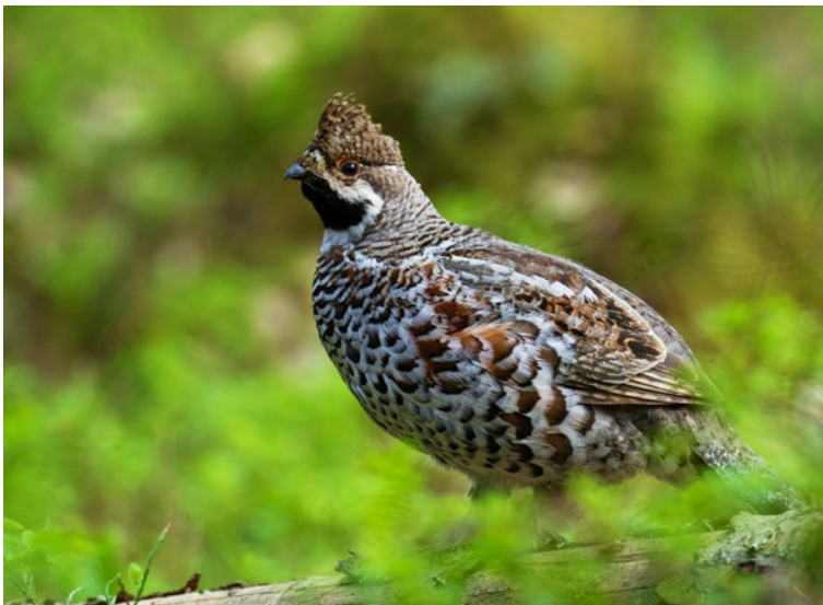
Male Hazel Grouse in a Forest in Central Estonia

The hazel grouse ( Tetrastes bonasia ) is a threatened bird that lives in forests older than 30 years. It is listed in Annex I of the EU Birds Directive and the population shows a 25 per cent decline in the last five years. 69 Destructive logging has taken place of a mapped habitat of hazel grouse on Graanul Invest-owned forest land in Nõmme, Pärnu County, West Estonia (see Photo 8).