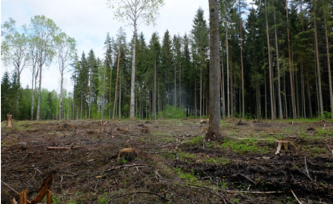
A clearcut WKH in Tromsi village that never made it to the official environment registry to gain formal protection. © ELF, 24 May 2021