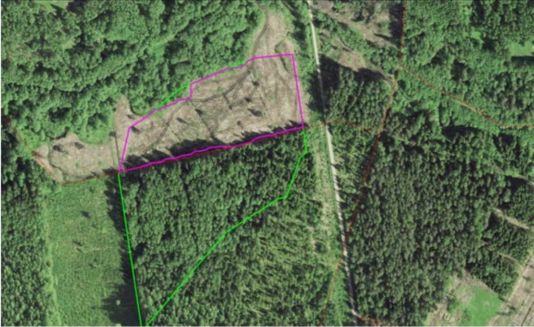
Photo 9: Karjasoo, Viljandi County. The red line marks the land unit of Roger Puit AS forest company. The green line is the breeding habitat of the red-breasted flycatcher and pink is forest loss/clearcut from 2014-2018.