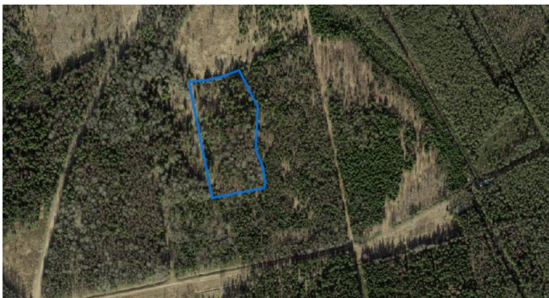
Photo 3: WKH in Mäksa village that was clearcut before it could be registered for protection.

A WKH with an area of 1.9 hectares was clearcut in Mäksa, Tartu county, South Estonia (see Photo 3). The WKH was mapped in October 2019 but was felled before it was officially registered. It was a spruce forest mixed with deciduous trees, also with biologically old aspens. Four indicator species that point to high natural value of the forest and to old-growth characteristics were found in the WKH, of which two were protected – the moss Neckera pennata and the lichen Leptogium saturninum . Feeding traces of the threatened three-toed woodpecker ( Picoides tridactylus ) were also found.