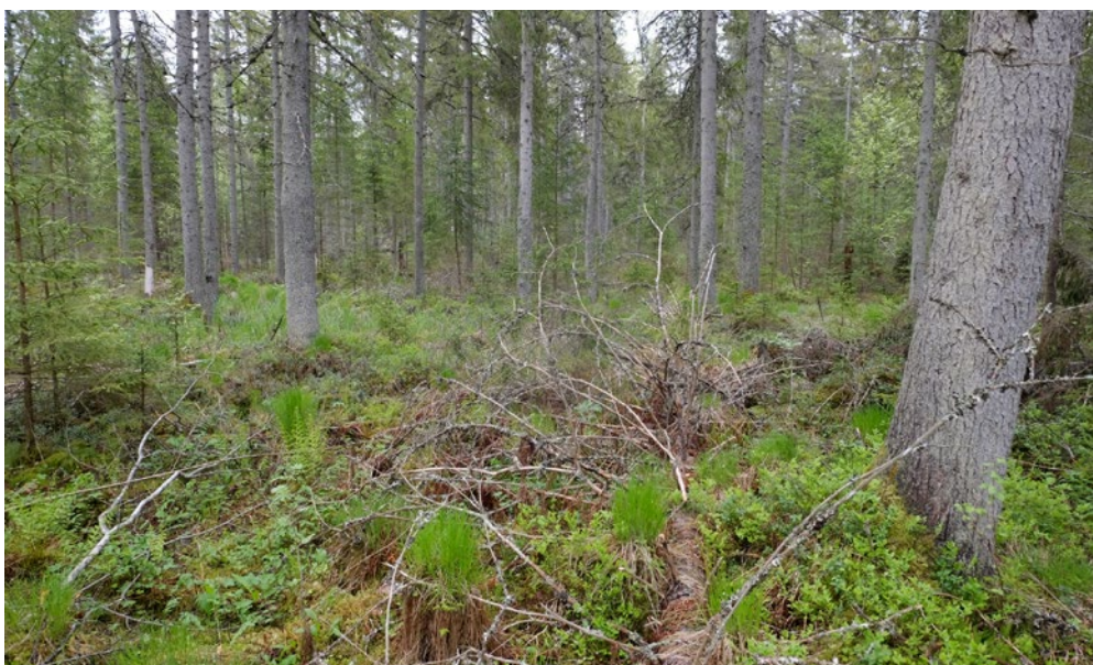
Photo 6: Wet spruce forest on Graanul owned land in Vana-Tüki, Valga County, South-East Estonia, for which logging permits have been issued. © ELF, 25 May 2021

A 106-year-old wet spruce forest with a lot of deadwood and structure characteristic to Habitat Directive type Fennoscandian herb rich forest, with Picea abies (9050) can be seen in the picture in Photo 6. This forest has never been mapped as such although it grows in Otepää nature park, which is part of Natura 2000 network. This forest also has active clear-cut forest permits on it and it belongs to Valga Puu, a Graanul Invest subsidiary.