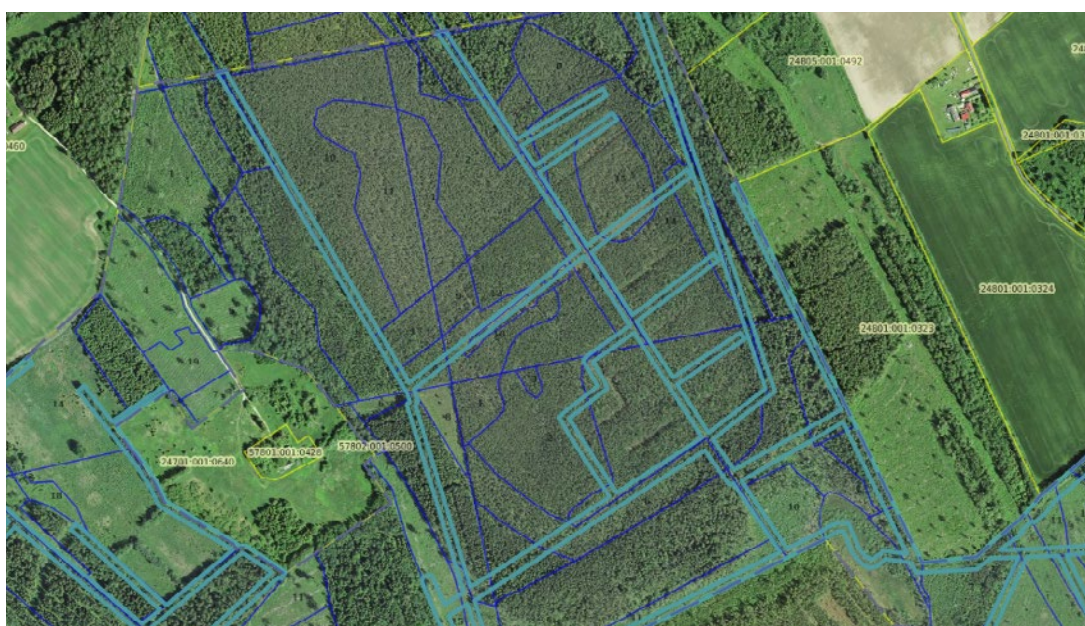
Photo 32: Aerial photo of an area of Kuremaa state forest where the drainage renovation (light blue) is planned.

The state forest in Kuremaa, Jõgeva County, Central Estonia, is an example of a forest where drainage restoration works are planned in Estonia (see Photo 32). A deforestation permit has already been issued for the drainage restoration works in this state forest area.