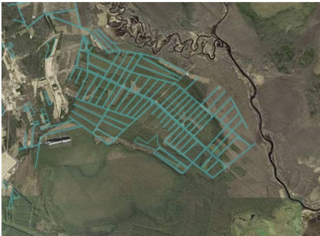
Photo 34: Satellite image of the state forest in Meleski with the ditches planned for renovation in light blue.