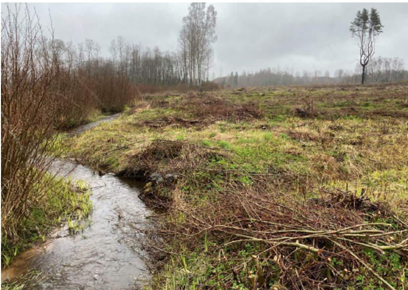
Photo 24: A clearcut area on Kivioja streamside with no trees left in the 10-metre restriction zone of bodies of water.