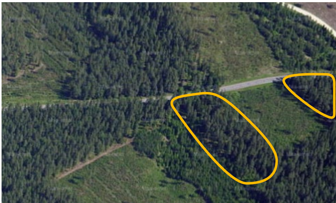
Photo 14: An orthophoto of the Tinnipalu site. The yellow line marks the area that will be logged.