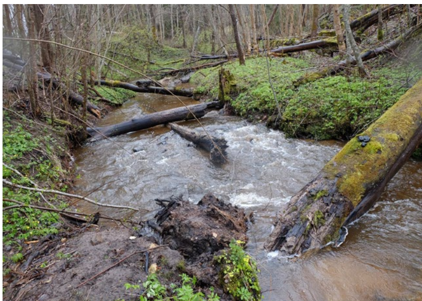
Photo 26: Kivila stream with its beds unaffected by logging. A few hundred metres downstream, there are clearcuts. © ELF, 3 May 2021

Kivila oja is a forest stream in a mostly natural bed, situated in South-East Estonia (see Photo 26). A clear-felling on both sides of the stream was detected on Graanul Invest-owned lands. A few retention trees – trees that are permanently left standing to promote biodiversity – were left to grow. Deep tractor tracks can be observed along the stream (see Photo 27) as well as washed away soil (see Photo 28).