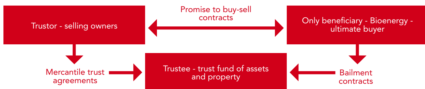
Figure 1 'Real estate trusts'

Elaborated by SOMO-Indepaz on the basis of public deeds of the mercantile trust agreements signed by Bioenergy.