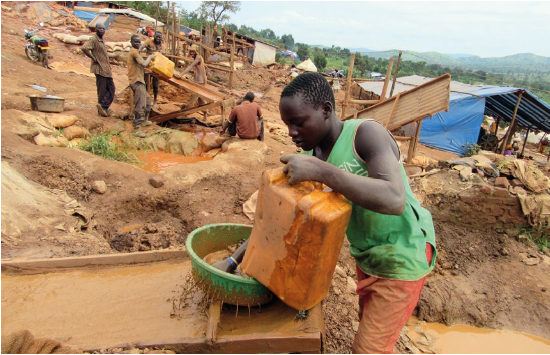
Sluicing the gold dust