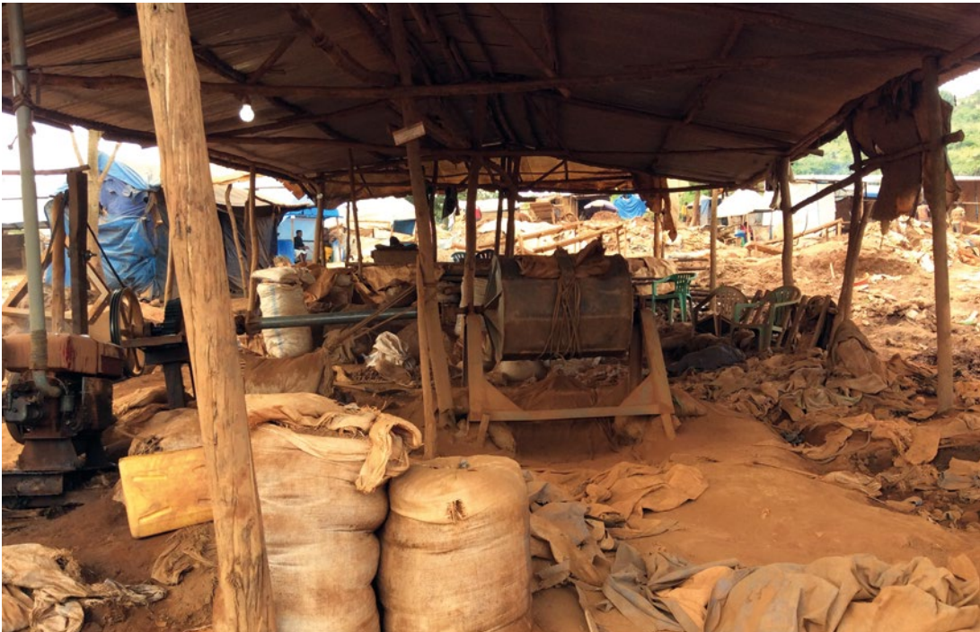
In a mill the gold ore is being grinded into gold ore dust