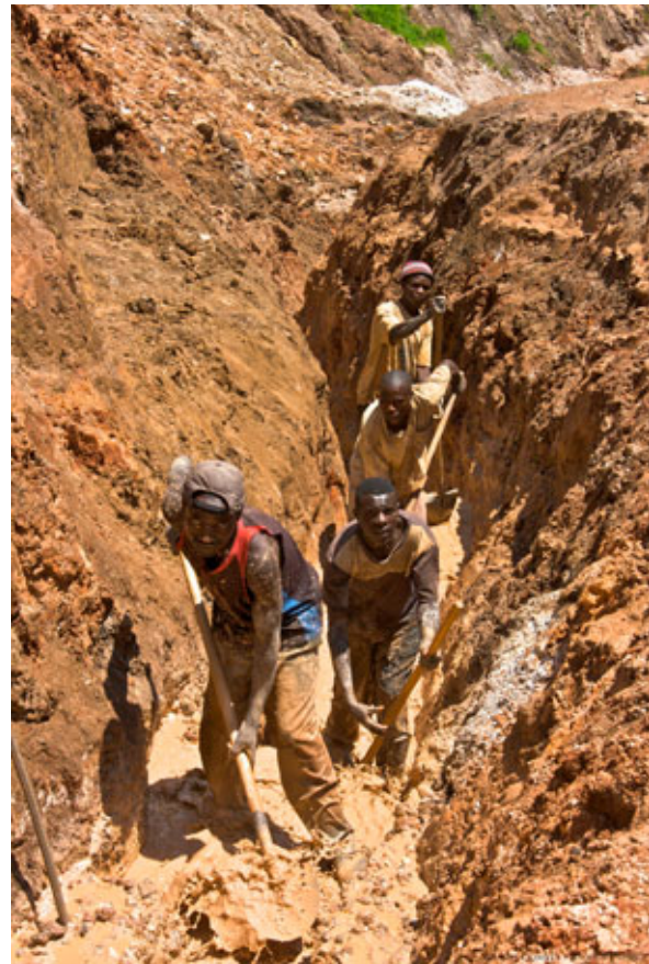
TANTALUM MINING IN SOUTH KIVU.

Other companies, such as TeliaSonera, Donaldson and Nikon, stand out because despite growing public awareness on this issue, neither Nikon nor TeliaSonera have made much effort to independently trace or audit their supply chains concerning the issue of conflict minerals. US-based Donaldson Company, a manufacturer of semiconductors, replied that it is in the process of developing and communicating a company policy regarding conflict minerals. TeliaSonera, based in Sweden, does have a standpoint on Tantalum from 2011, however the company does not address the other conflict minerals and is not clear on what it requires from suppliers. In November 2012 TeliaSonera announced that it had joined the Joint Audit Cooperation (JAC), an audit partnership