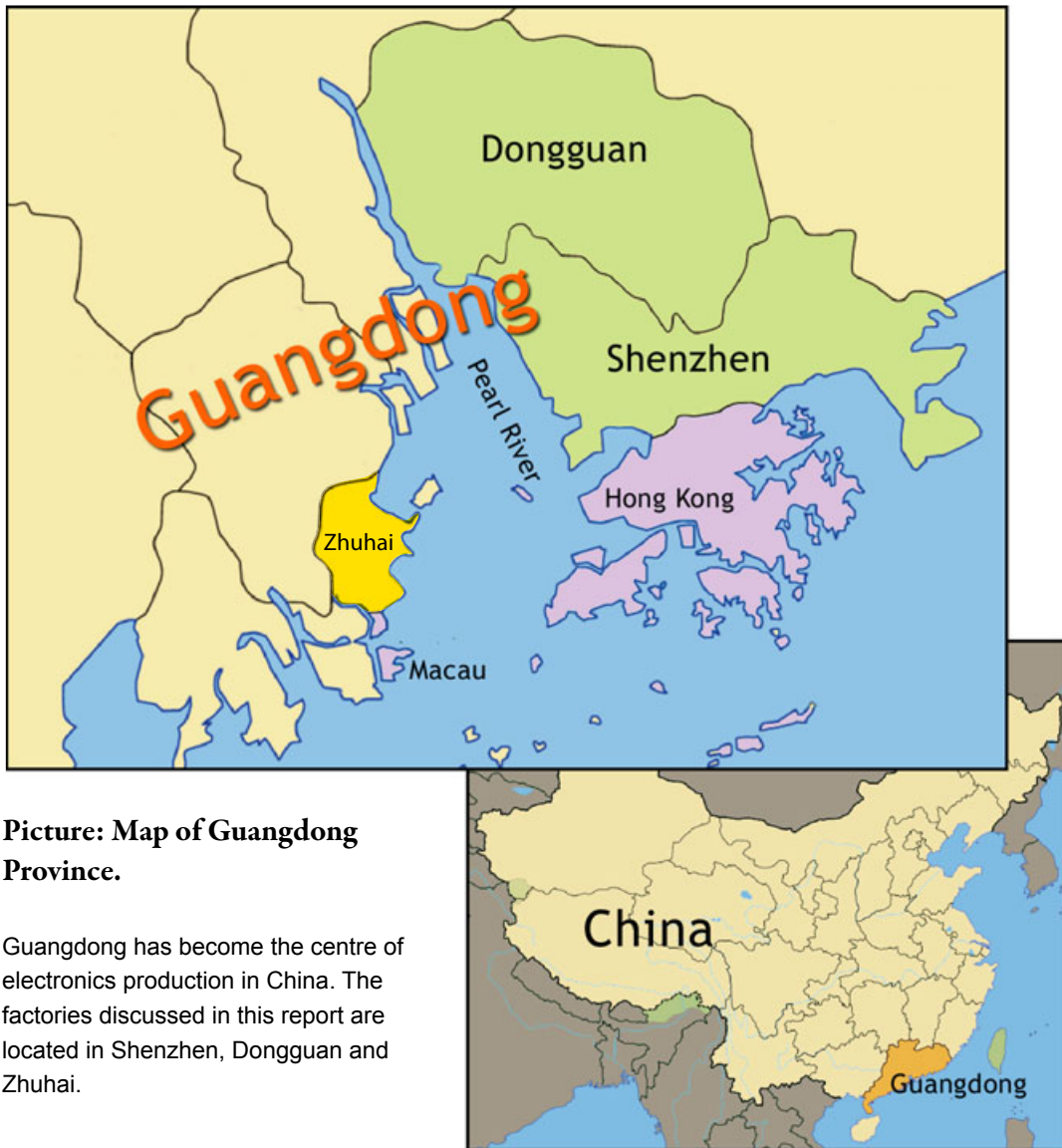
Picture: Map of Guangdong Province.

Guangdong has become the centre of electronics production in China. The factories discussed in this report are located in Shenzhen, Dongguan and Zhuhai.