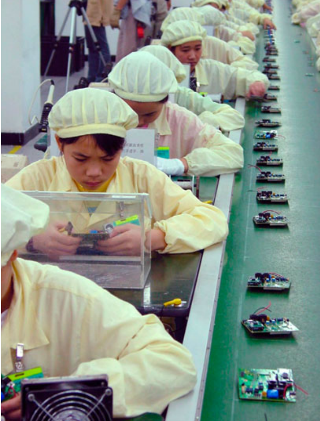
Assembly line workers in electronics factories are often women, favoured for their obedience and quick fingers. Picture is from China.

The world's biggest electronics contract manufacturers have established a firm base in China, with several factories. This report takes a look at four of them, namely Canadian Celestica, Singapore-based Flextronics International, Vista Point Technologies of Flextronics and Taiwan-based Hong Fu Jin Precision Industry, under the trade name Foxconn. 40 Foxconn and Flextronics are the world's biggest contract manufacturers of electronics. In 2007, Foxconn was also China's biggest exporter. 41 Foxconn has in all 550,000 employees and an income of US$ 51.8 billion. Flextronics employs 162,000 employees and has an income of US$ 27.6 billion. 42 It is difficult to say whether seasonal and contract workers have been included in these figures.