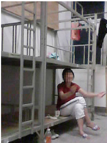
Each dormitory room sleeps 8–10 workers with very little space and privacy.

Apple's code requires dormitories to be clean and safe and provide adequate personal space.