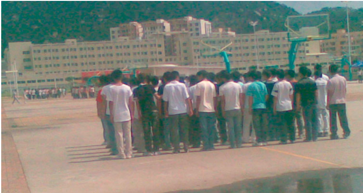
New recruits undergoing disciplinary training.