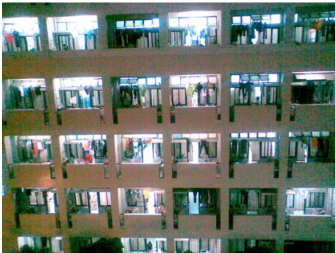
Facade of a crowded dormitory and litter discarded on a balcony where workers wash basins are also located.

Celestica says it pays the total cost of all contract workers' insurance and pensions, together with their wages, to the labour agencies. SACOM was told that sometimes, in order to save money, labour agencies employ under 18-year-olds with fake identity cards providing them only with occupational injury insurance, not social insurance. It is not known if Celestica is aware of these cases.